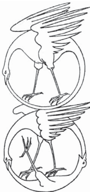
Birds from an alchemical manuscript of 1550 in Basle University Library.

another was already common in early Irish-Anglo-Saxon art. In Romanesque sculpture it occurs so commonly and plays such a striking role in the decoration of sacred buildings, 18 that one might readily conclude that it was a kind of “signature” of certain Christian-Hermetic schools. Moreover, the same motif is connected with the symbol of the knot, whose cosmological meaning lies in the fact that the harder one pulls on the knot, the more firmly its two constituents hold together.