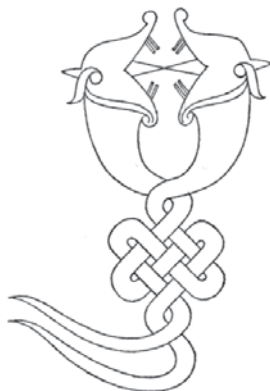
Pair of dragons from an Arab talisman.

This fable supplements the Hermetic myth of the staff of Hermes. Hermes, or Mercury, struck with his staff a pair of serpents in combat with one another. The blow tamed the serpents, which wound themselves round his staff and conferred on him the theurgic power of “binding” and “loosing”. This means the transmutation of chaos into cosmos, of conflict into order, through the power of a spiritual act, which both discriminates and unites.