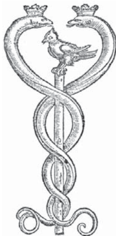
The staff of Hermes, or caduceus, from a drawing by Hans Holbein the Younger.

their downfall and decomposition, their first, natural forms, in order to acquire a single, new, nobler, and better form. 15