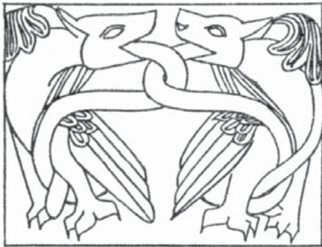
Pair of dragons from the Romanesque choir of Basle Cathedral.

In the Jewish tradition, as a counterpart to the staff of Hermes and the Hindu symbol of Brahma-danda , 16 we find Moses' rod, which indeed turns itself into a serpent. In Islamic mysticism, Moses' rod, which "on God's command" turned into a serpent, and on being "grasped" by Moses turned back into a rod, is compared with the passional soul ( nafs ), which through the influence of the Divine Spirit can be turned into a wonder-working power. Because it incorporates a spiritual power, Moses' rod, turned into serpent, can vanquish the serpents engendered by the Egyptian sorcerers and made of magic—and therefore psychic power; for the Spirit prevails over the soul and its domain. 17 This interpretation of the story of Moses' rod, mentioned in the Koran, recalls the Hindu distinction between vidyâ-mâyâ (Universal Nature in her "enlightening" aspect) and avidyâ-mâyâ (Universal Nature as the power of illusion). In this distinction, moreover, is also to be found the deepest sense of the Hermetic proverb: "Nature can overcome Nature." From the alchemical point of view, the changing of Moses' rod into a serpent and its subsequent re-solidification corresponds exactly to the solve et coagula of the great work.