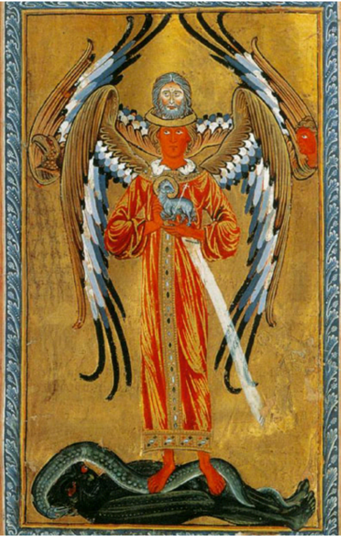
Figure 7. Caritas. Book of Divine Works . Book One, Vision One.

This vision perfectly encapsulates Hildegard's love cosmology, and as recorded in her Vita , unlike her standard visions, this one was so powerful that receiving it 'made all her organs tremble' and brought on a rare bout of ecstasy, suggesting its importance. 113 Allegorically, Hildegard explains that the bearded figure signifies the 'loving-kindness of the Godhead' and the lamb 'gentleness'. 114 Yet, it is scarcely possible not to read them as emblems of the Father and Son respectively, meaning that the fiery central figure can only be the Holy Spirit. 115 Indeed, Figure 7 reveals the Trinity as deliberately layered vertically from the