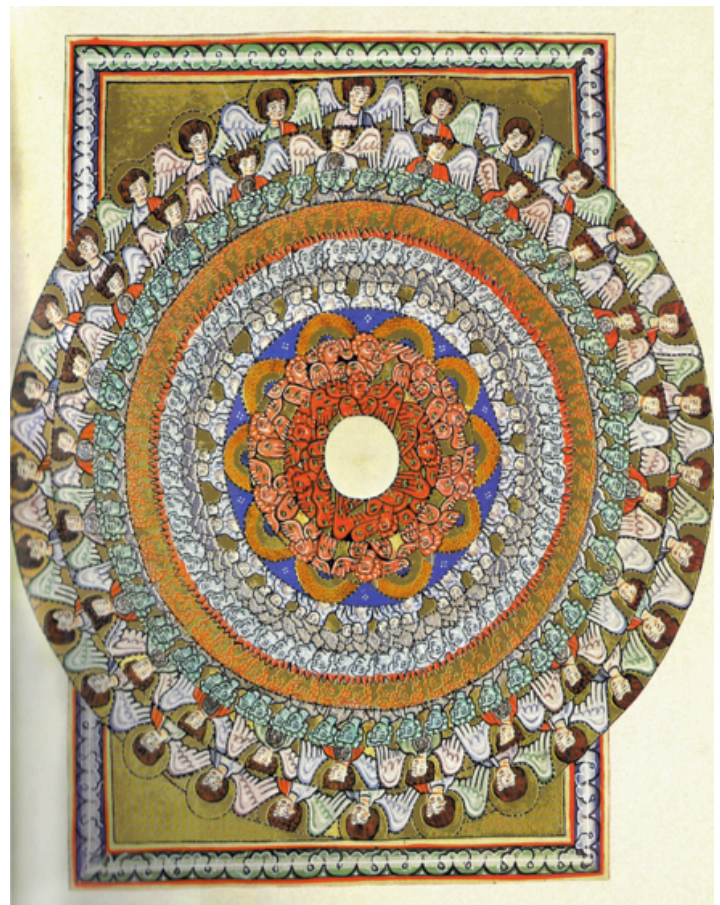
Figure 9. The Choir of Angels. Scivias. Book One, Vision Five.

Similarly, in Hildegard’s cosmology, we find the Pythagorean idea of the music of the spheres, as Hildegard notes that the ‘revolving of the firmament emits marvellous sounds, which we nevertheless cannot hear because of its great height and expanse.’ 143 Indeed, for Hildegard, the idea of “sympathetic vibration” too is significant in expressing divine love. One of the most important positions in the abbey was chantress. In Benedictine monasteries, the chantress not only directed the choir but also composed music for the psalms, and both lyrics and music of hymns for special feast days. 144 In fact, the technical sophistication