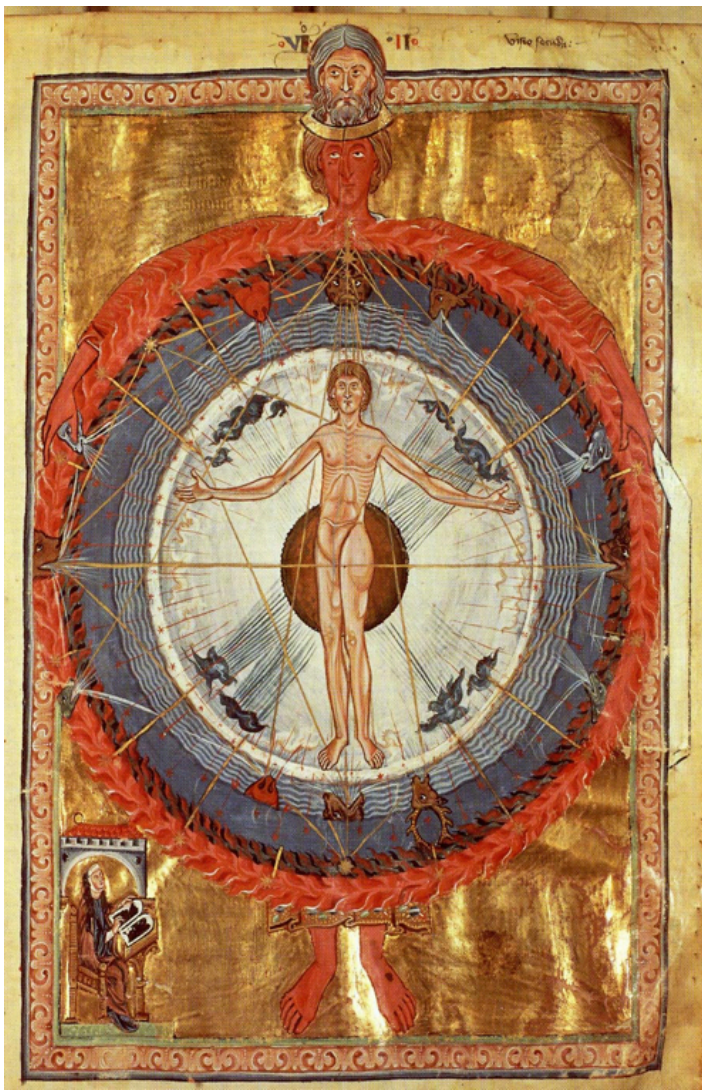
Figure 8. The Macrocosm and Microcosm. Book of Divine Works. Book One, Vision Two.

In essence, Caritas performs three things. First, she gives “life” to the universe; second, she is “reason”; and third, she carries out the “work” of God. 122 It is these three characteristics that liken her to both Bernard Silvestris’ goddesses Noys and Endelechia, and Alan of Lille’s Genius. Yet surprisingly, Hildegard never refers to Caritas as the World-Soul, either because she did not know the term, or she knew that the Cistercians had condemned Peter Abelard for aligning the World-Soul too closely with that of the Holy Spirit. 123 Considering that Hildegard Christianised her