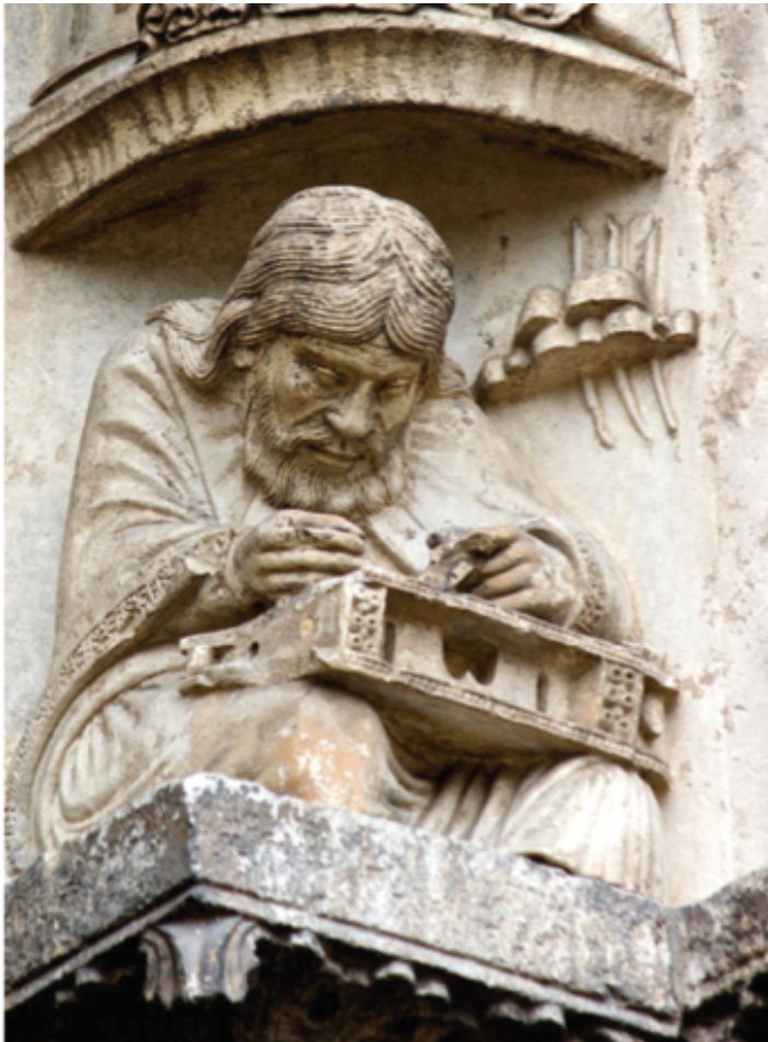
Figure 2. Pythagoras. Chartres. Royal Portal, Right Archivolt.

Harmony is literally being supported on the hunched shoulders of Pythagoras. 49 Like their human philosophers working at Chartres, ‘the arts can see further because they stand on the shoulders of real human giants.’ 50