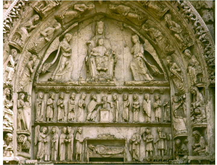
Figure 1. Chartres. Royal Portal, Right tympanum.

of the Royal Portal, in which Christ as the Sedes Sapientiae (‘seat of wisdom’) is placed at the centre of the portal, with the voissoirs surrounding the Logos constituting a recreation of the cosmos in miniature, embodying how wisdom is passed to man from God through the liberal arts. 45