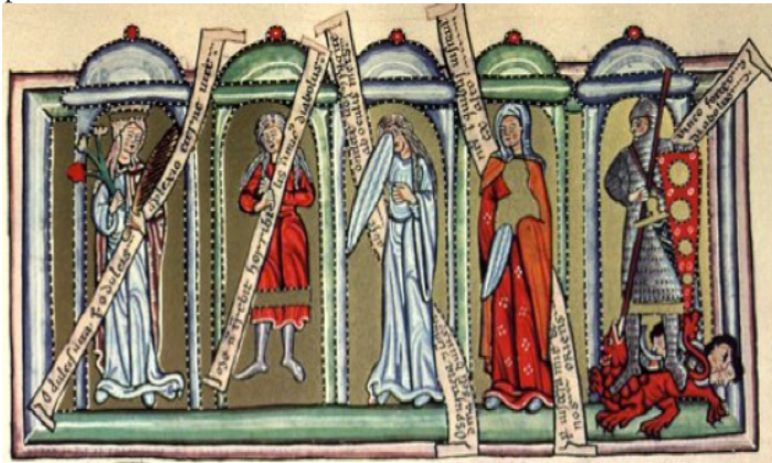
Figure 6. The Five Virtues in Five Towers. Scivias. Book Three, Vision Three. From left to right: Celestial Love, Discipline, Modesty, Mercy and Victory.

In Figure 6, Celestial Love appears with four other virtues: Discipline, Modesty, Mercy and Victory, all personified as women.